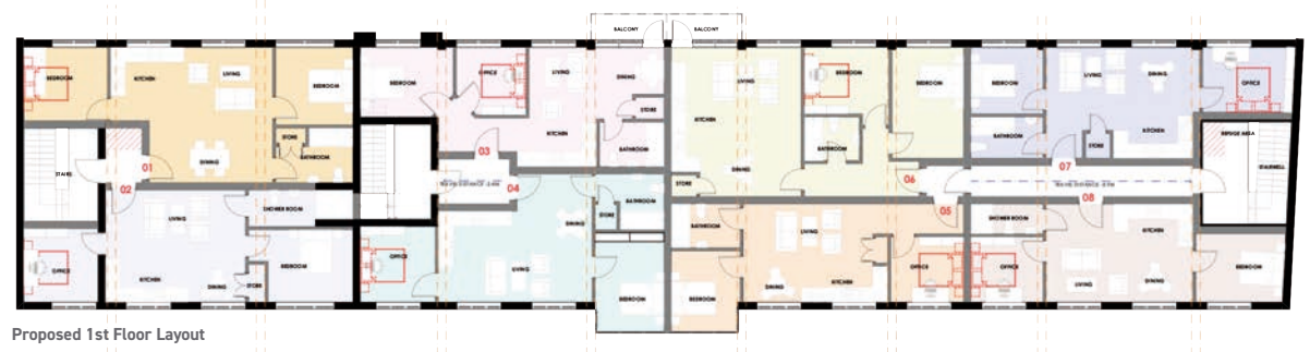
Proposed 1st Floor Layout