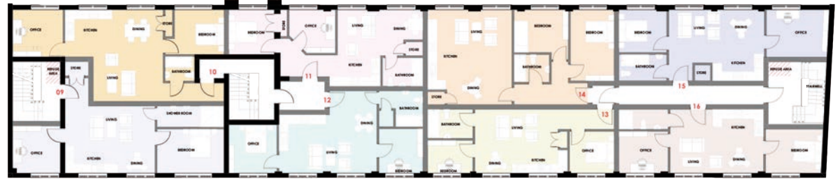
Proposed 2nd Floor Layout

The front ground floor retail unit of the building is let on a 10-year term expiring on 4th December 2023 with a passing rent of £45,000 per annum. It is currently let to Hobbs Carpets Sales Limited. The unit at the rear of the property is let for £6,500 per annum expiring in March 2025. This unit is currently let to CJB Systems Designs Limited.