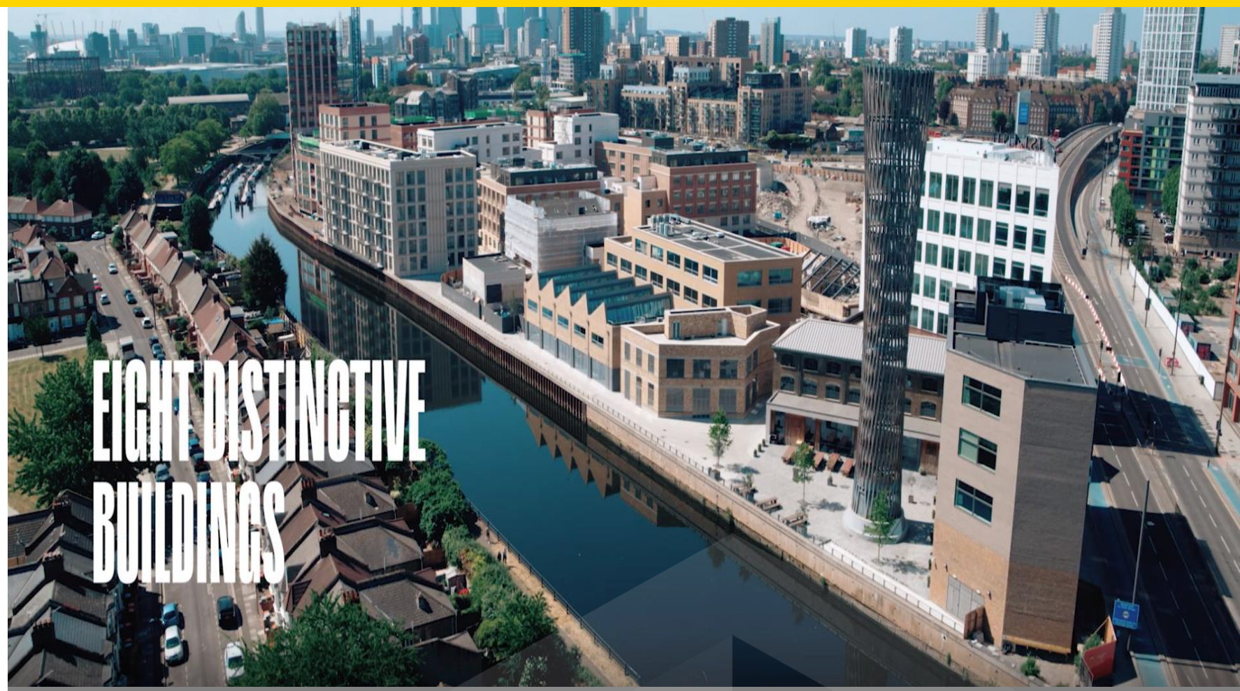
For further information please contact:

Strettons for themselves and for the vendors of this property give notice that: a) the particulars are set out as general outline only for the guidance of intending purchasers and do not constitute, nor constitute part of, an offer or contract; b) all descriptions, dimensions, references to condition and necessary permissions for use, lease details and occupation and other details are given in good faith and are believed to be correct, but any intending purchaser should not rely on them as statements or representations of fact but should satisfy themselves by inspection or otherwise as to the correctness of each of them; c) no person in the employment of Strettons has any authority to make or give any representation or warranty whatsoever in relation to this property. Subject to Contract. August 2022.