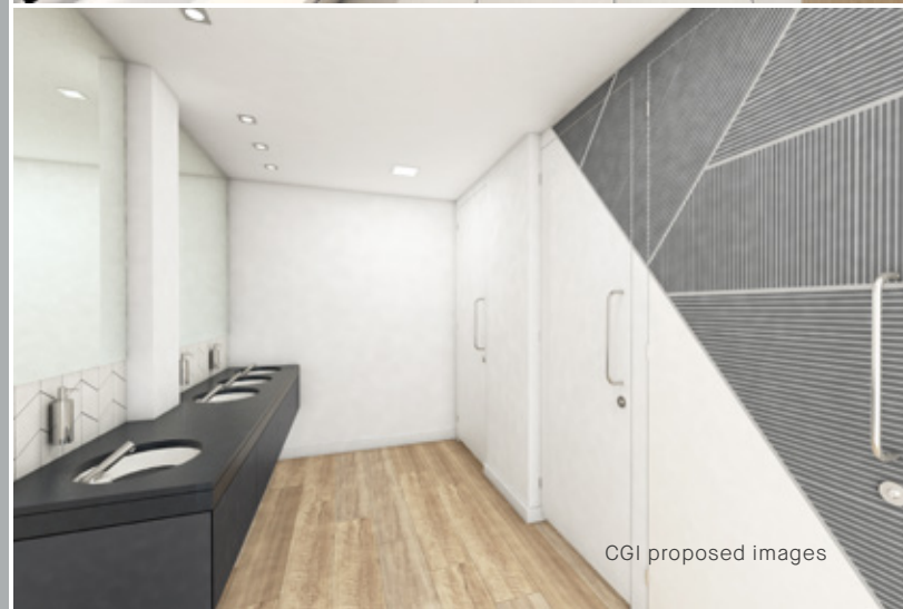
CGI proposed images