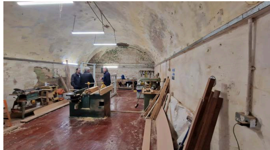
Unit 11 Internal

Call us on: 01329 220 111 Visit: www.hlp.co.uk