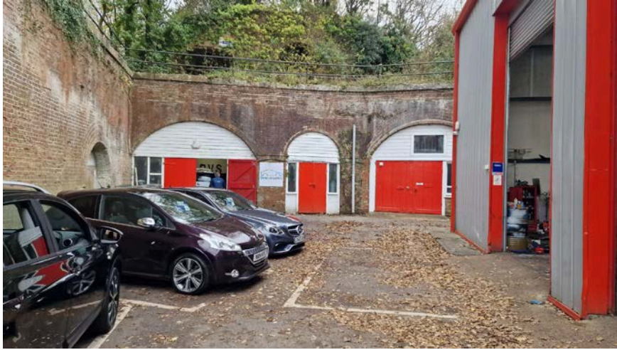
Dartmouth Buildings – Arches