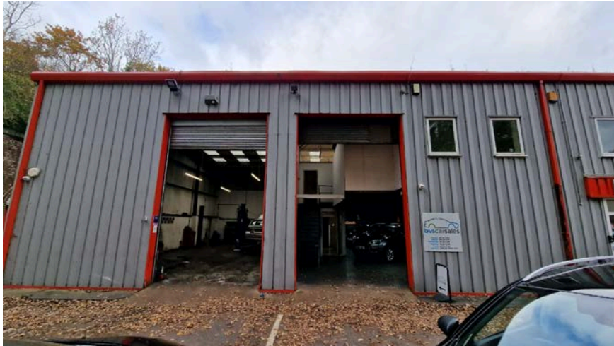
Units 1 & 2