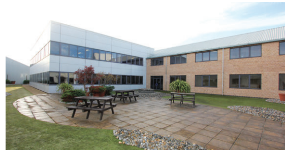
Communal Courtyard Garden.