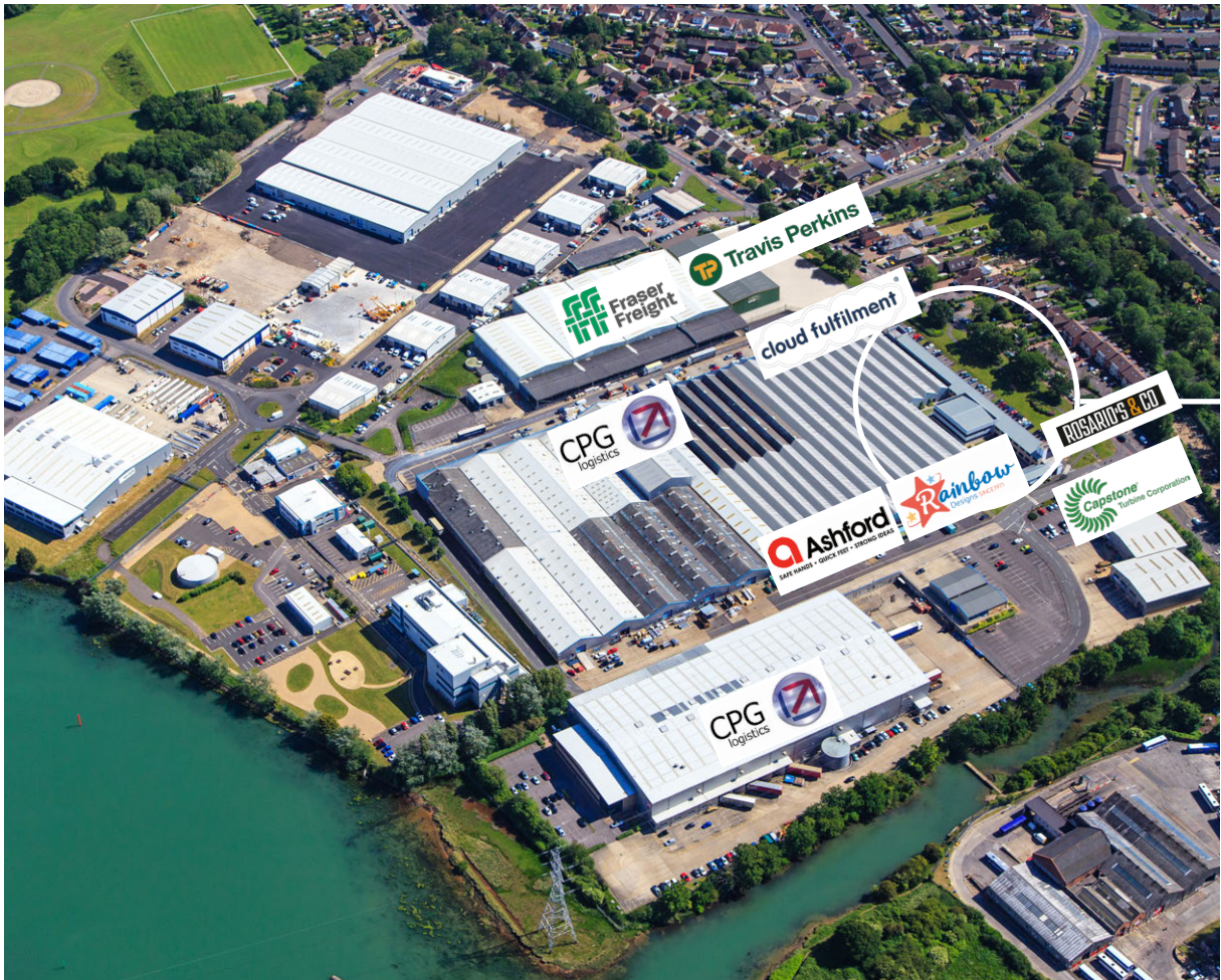
Aerial photograph of Fareham Reach Business Park looking south west.