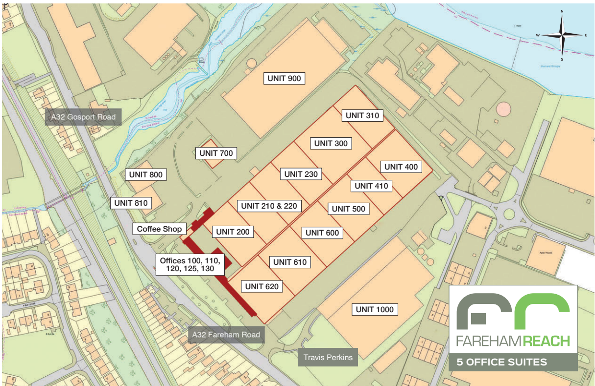
Licence number 100022432.