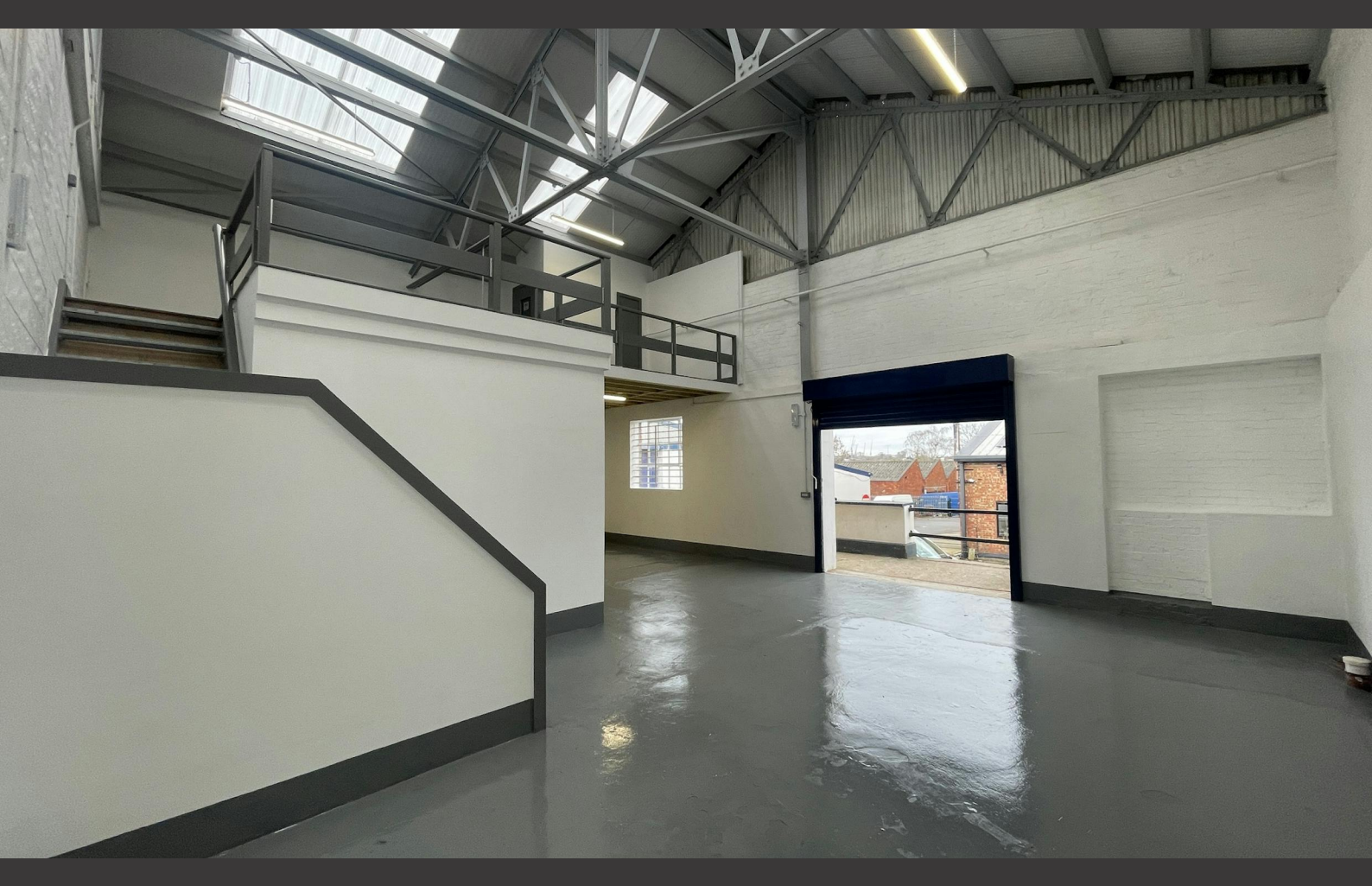
Unit 16A, Atlas Business Centre Oxgate Lane, Staples Corner, NW2 7HJ