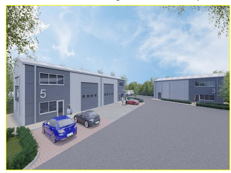
REFURBISHED POTENTIAL CGI'S (more images available on request)