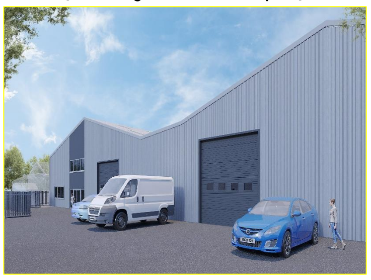
64,747 SQ FT (6,015.19 SQ M) Site Area: Approx. 2.36 Acres