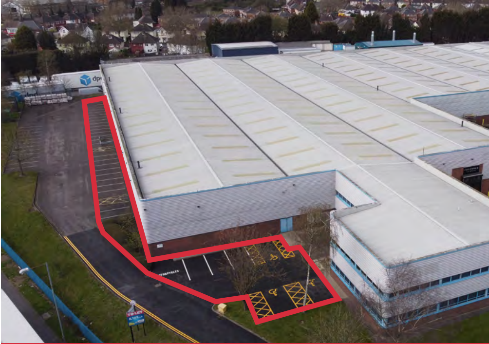
Secure yard with additional parking space