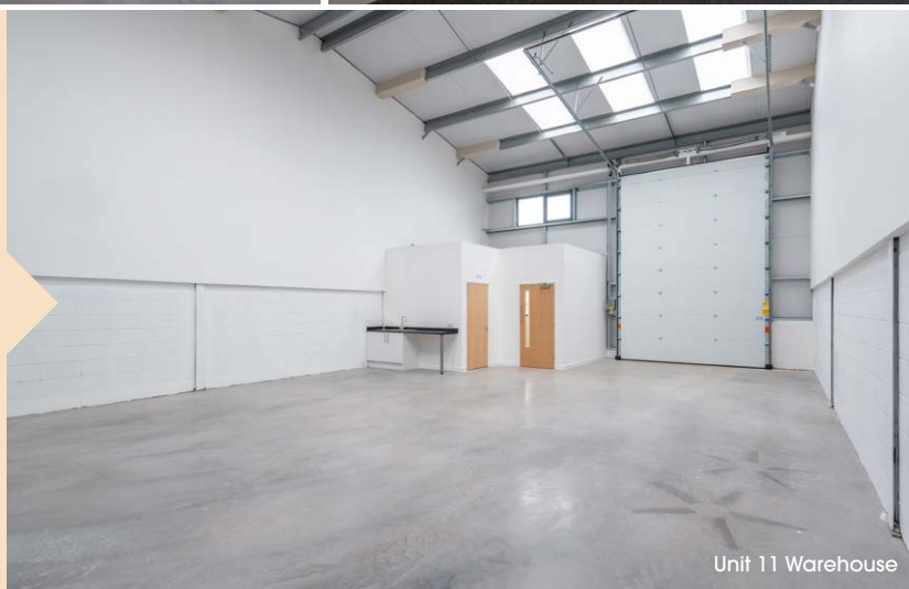
Unit 11 Warehouse