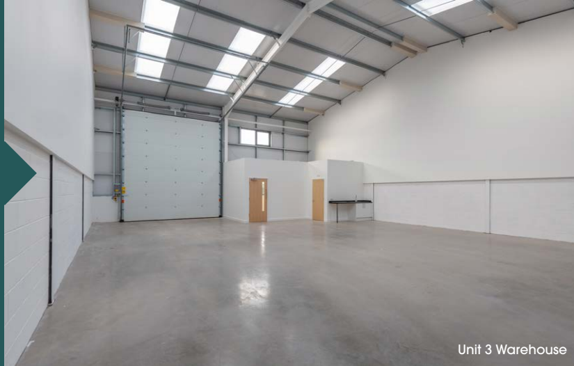
Unit 3 Warehouse