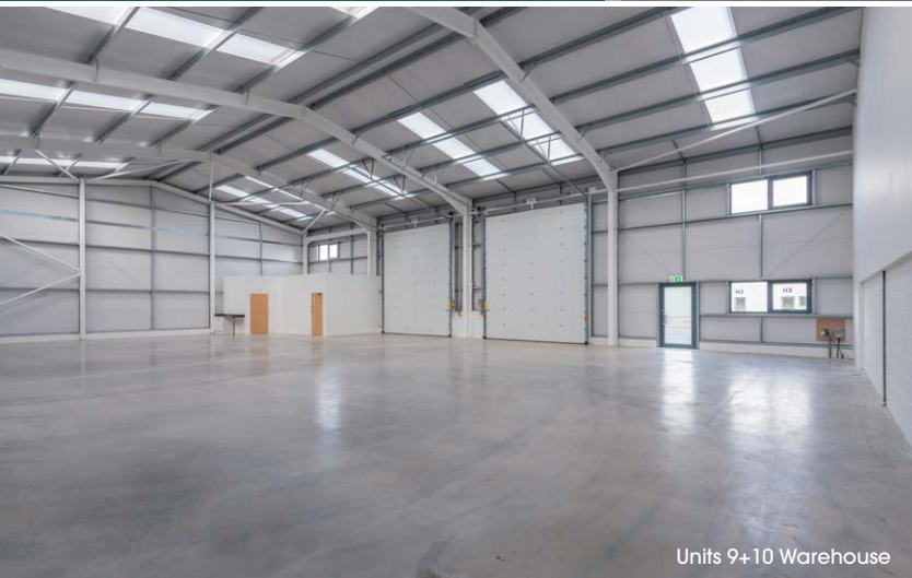
Units 9+10 Warehouse