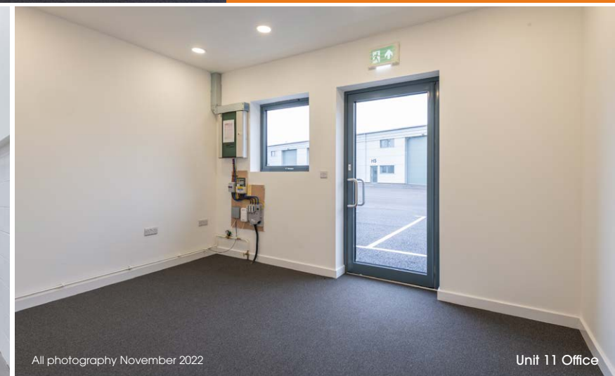
All photography November 2022