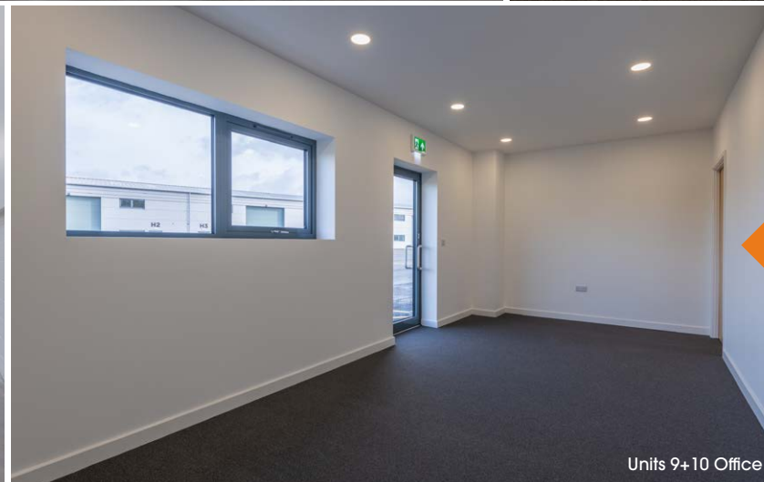
Units 9+10 Office