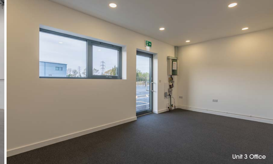
Unit 3 Office