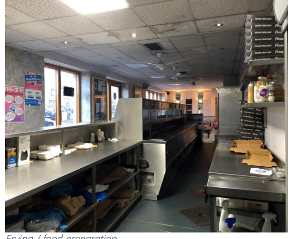
Frying / food preparation