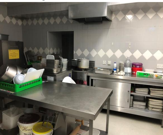
Food prep/ kitchen