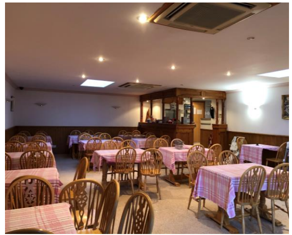
First floor seating