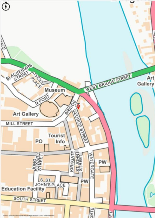
Plotted Scale - 1:4000. Paper Size – A4

The foregoing areas have been calculated on a net internal area basis in accordance with the RICS Property Measurement Guidance (2 nd Edition)