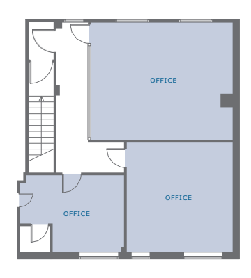
UNIT 23 First Floor Offices