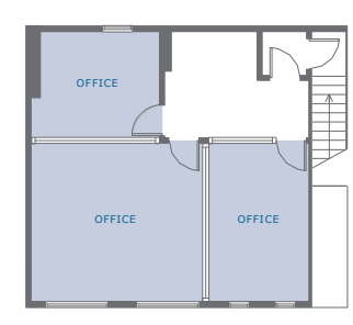
UNIT 22 First Floor Offices