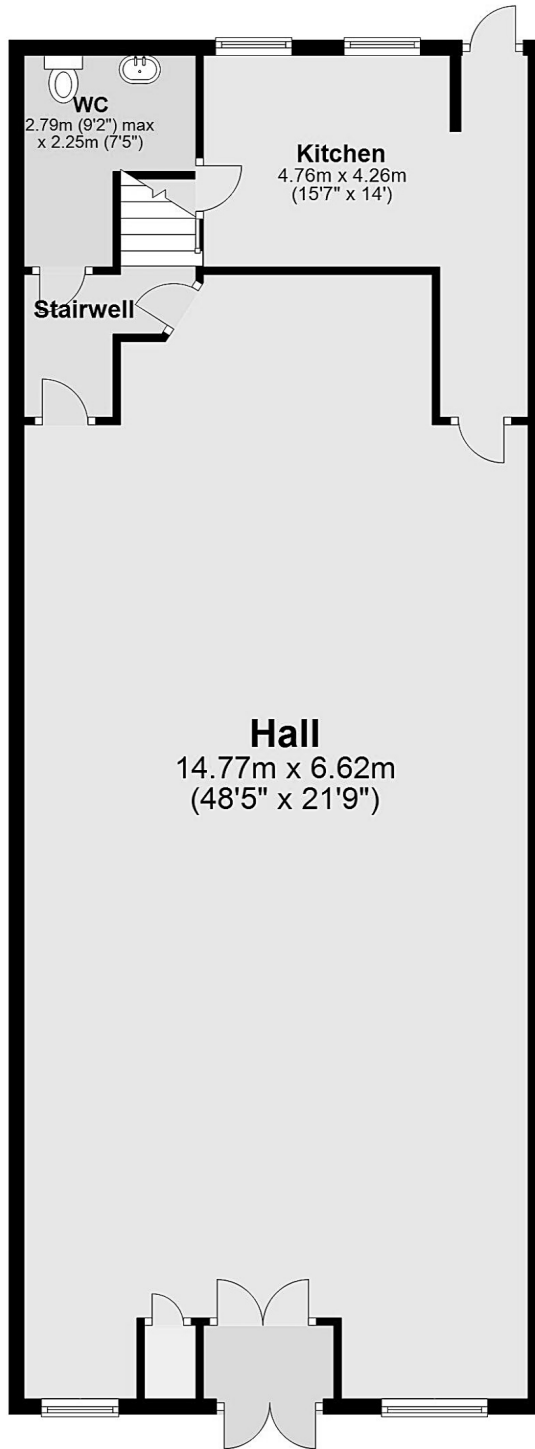
Ground Floor Approx. 116.9 sq. metres (1257.9 sq. feet)