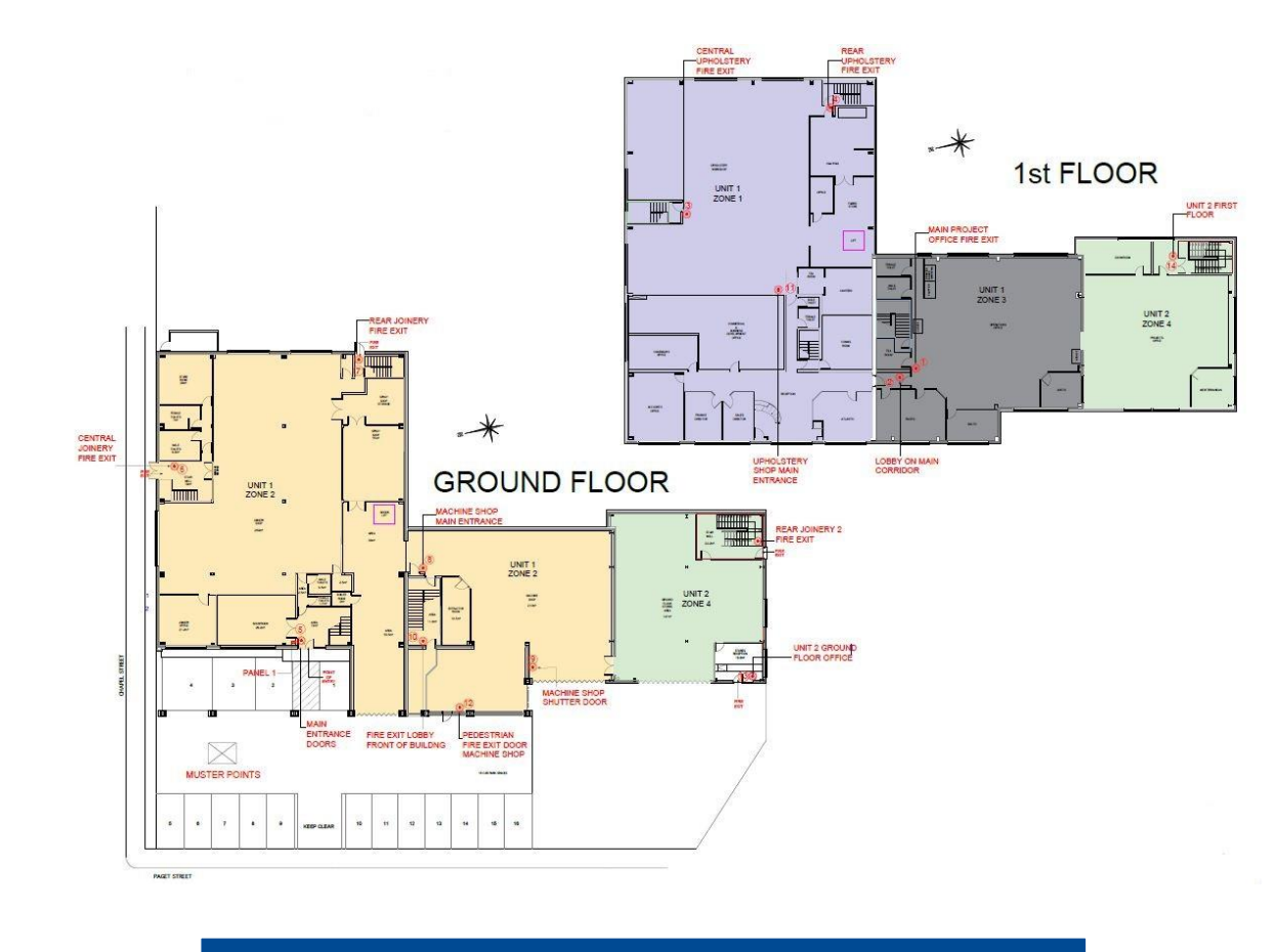
Floor Plan – Not to Scale