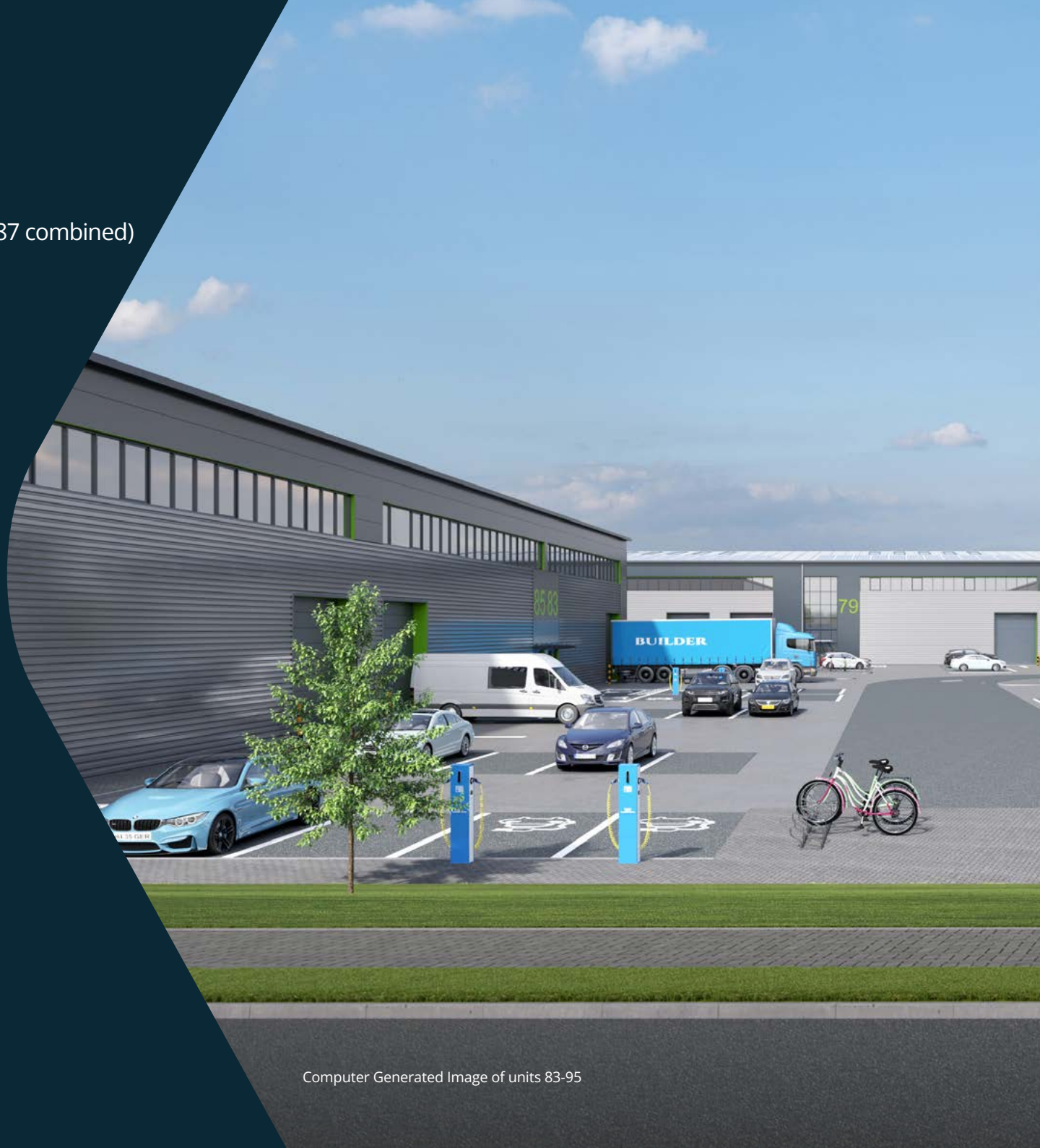
Computer Generated Image of units 83-95