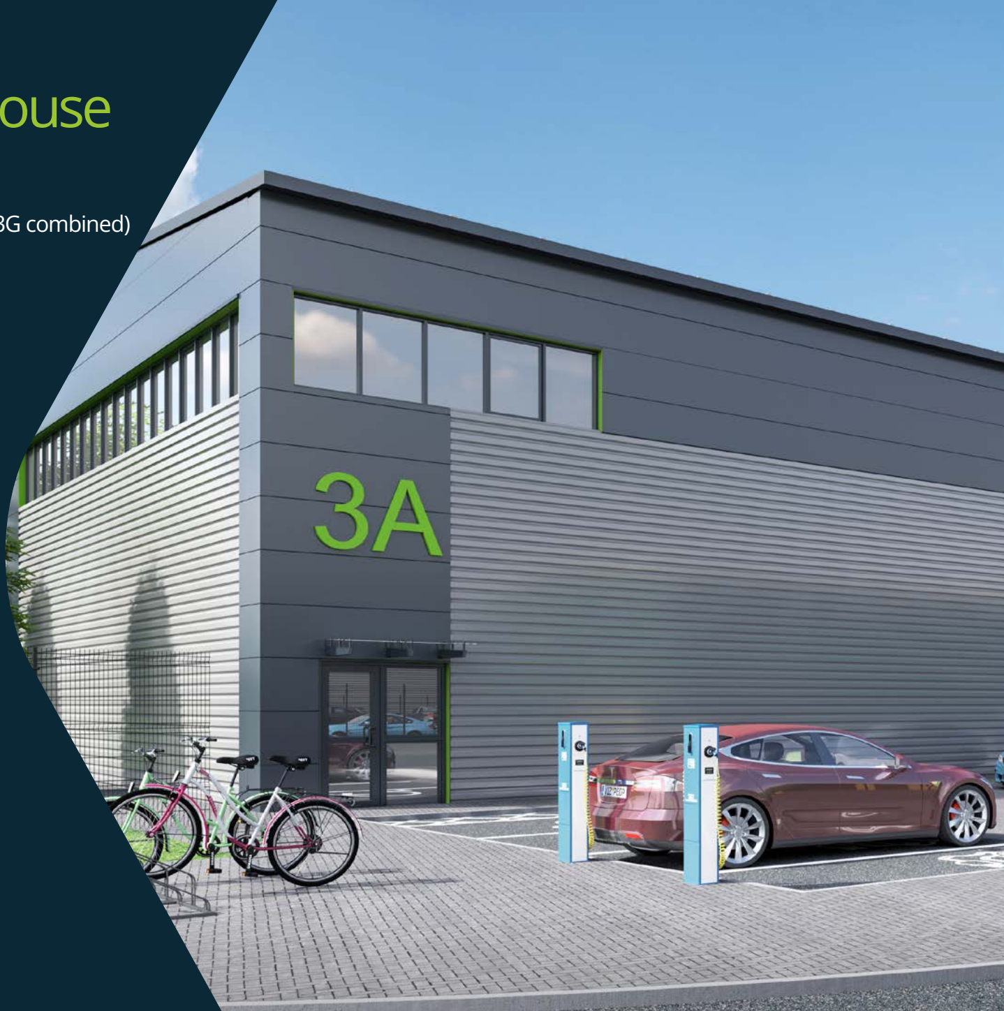
Computer Generated Image of units 3A-3G