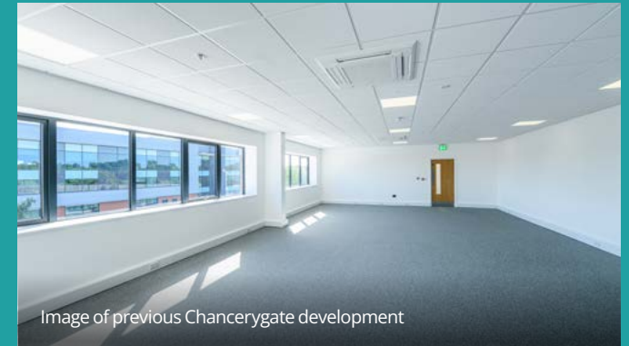
Image of previous Chancerygate development