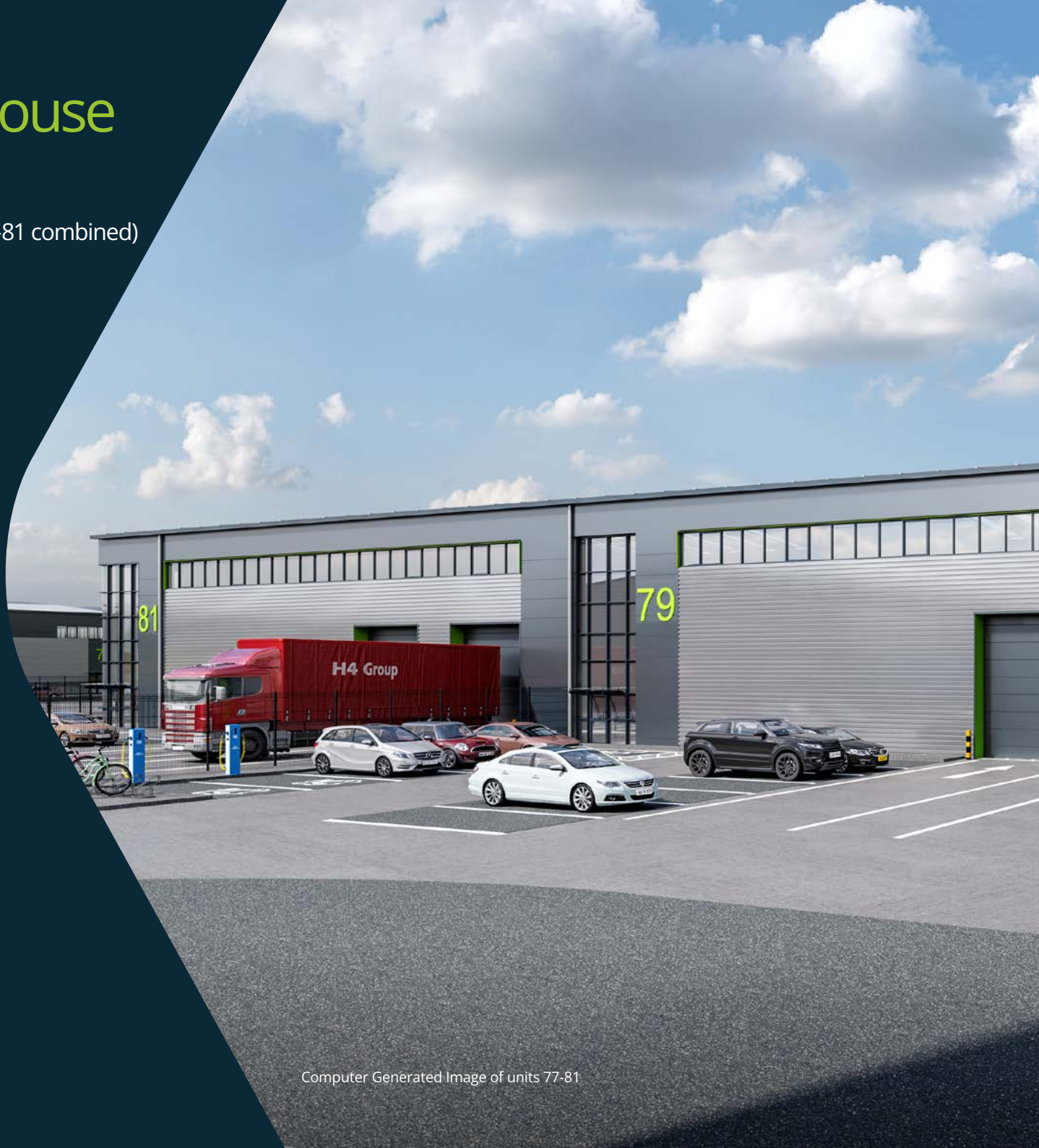
Computer Generated Image of units 77-81