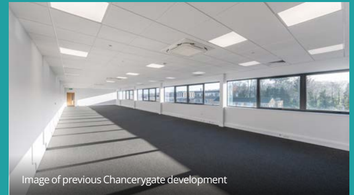
Image of previous Chancerygate development