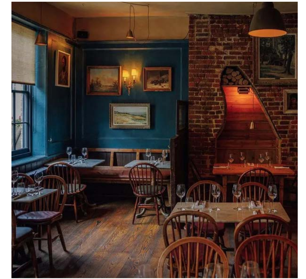
Lore of the Land