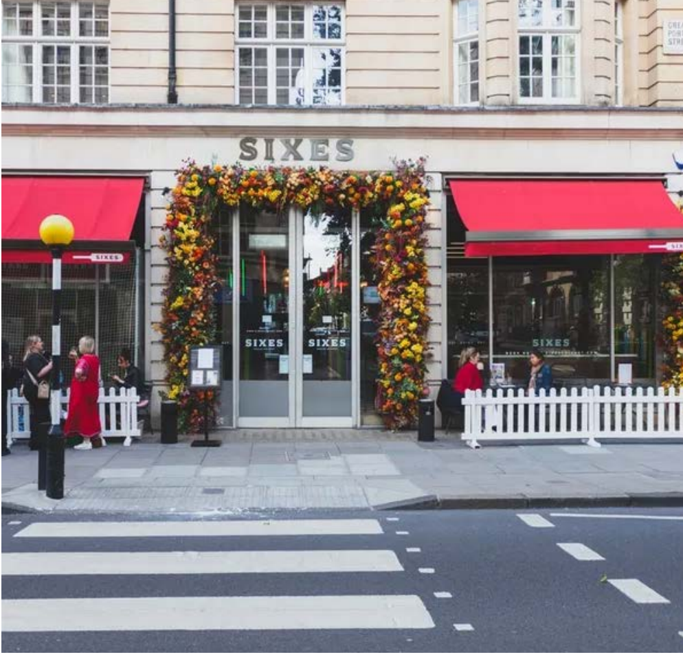
Sixes Social Cricke