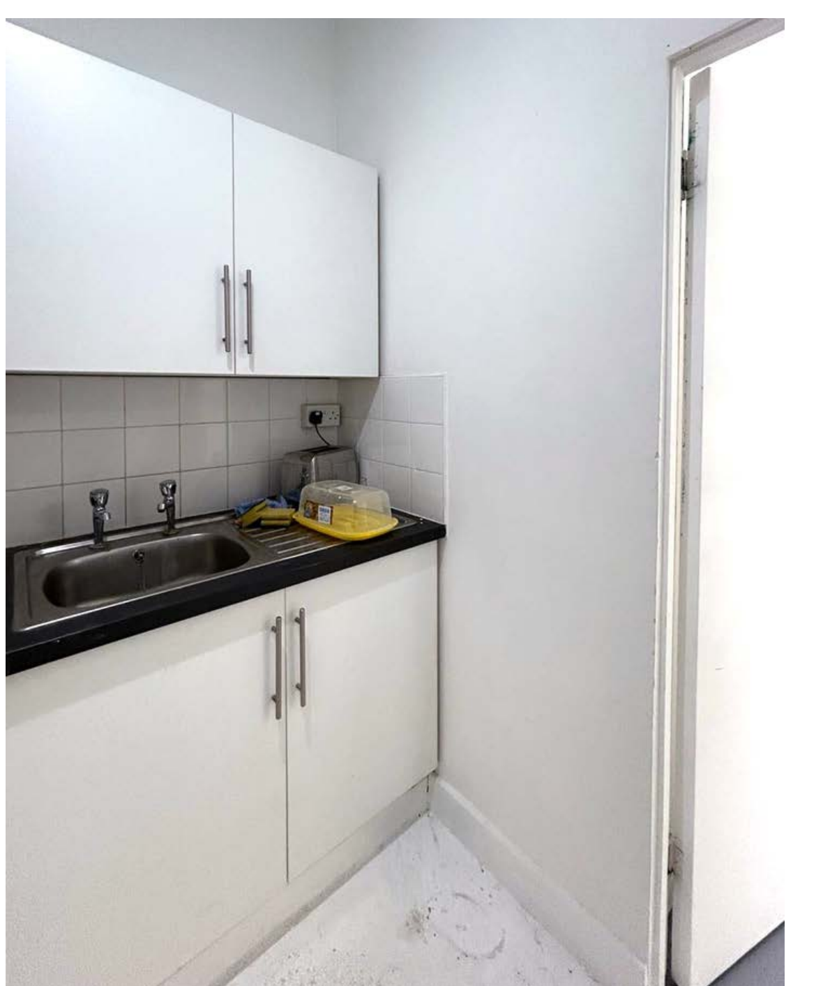
158 NEW CAVENDISH STREET