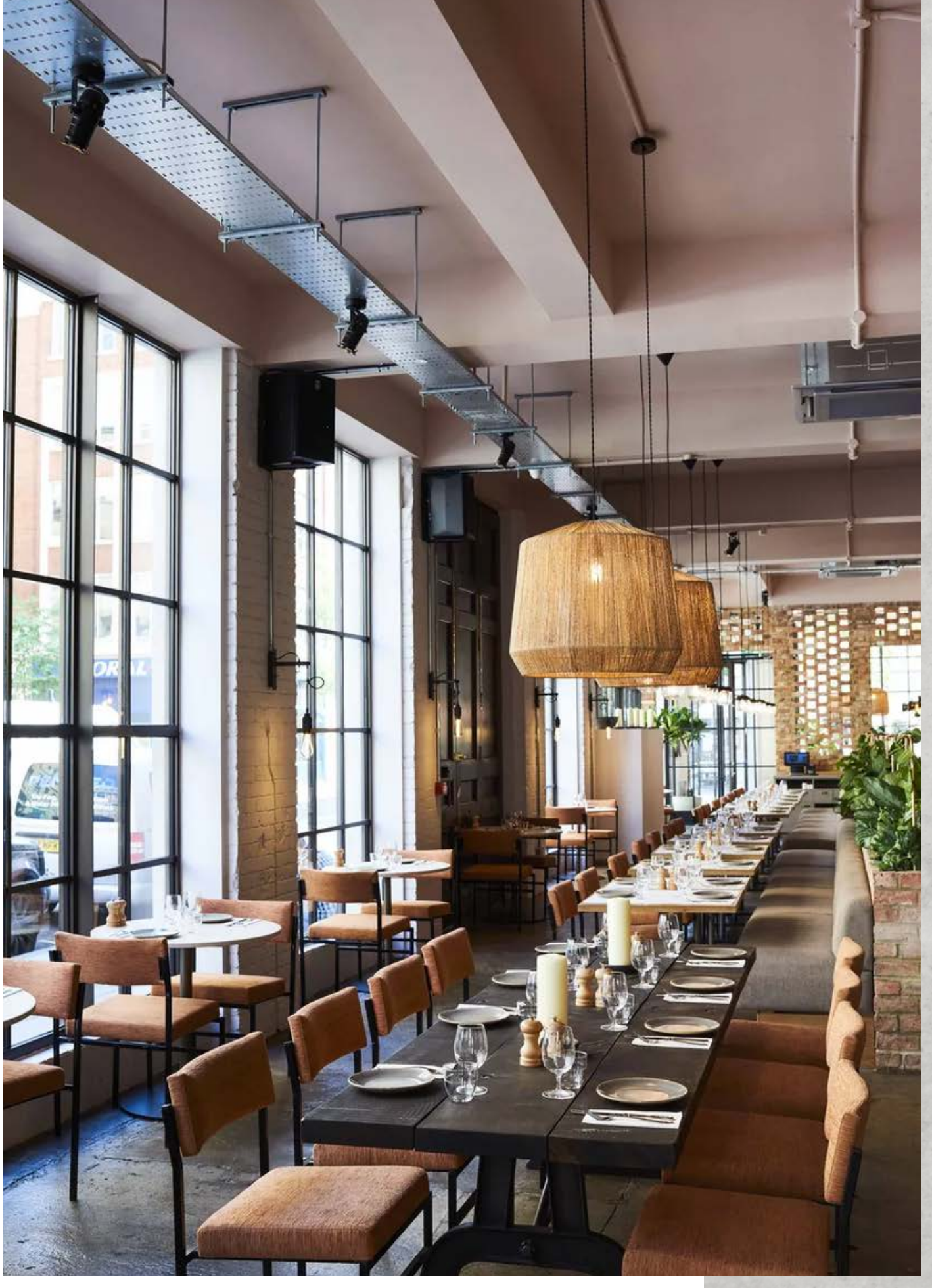
Caravan Fitzrovia Restaurant