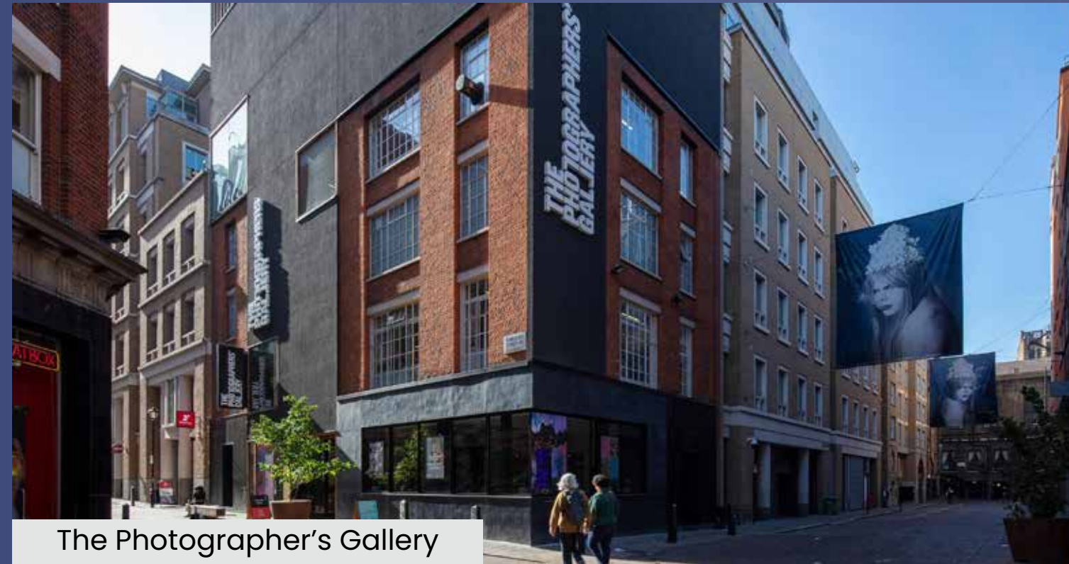
The Photographer's Gallery

The area is enriched by a multitude of well-known and high-end retailers, hotels, and restaurants, contributing to the vibrant atmosphere of the area.