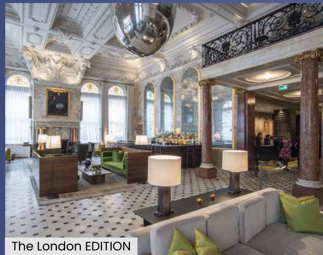
The London EDITION