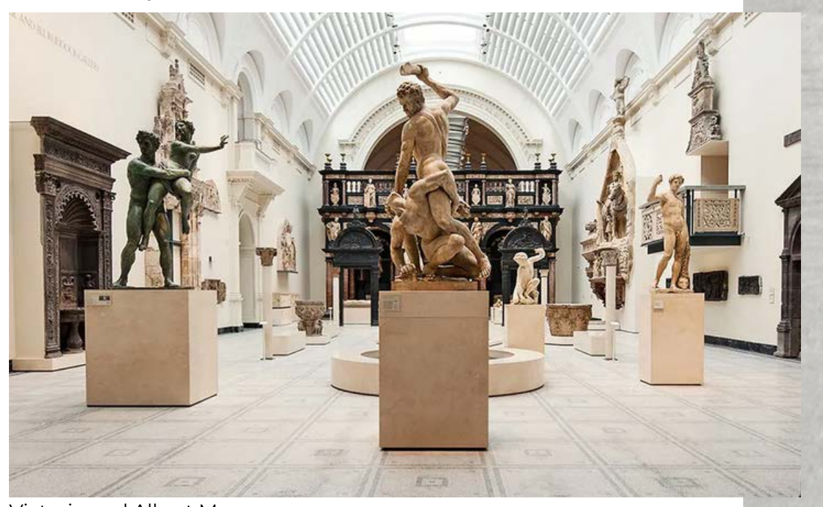
Victoria and Albert Museum