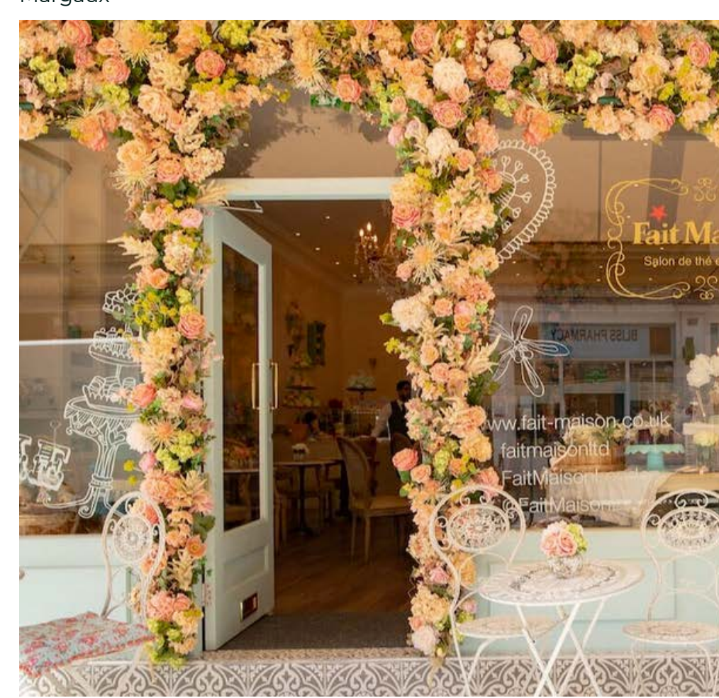
Fait Maison Salon de Thé