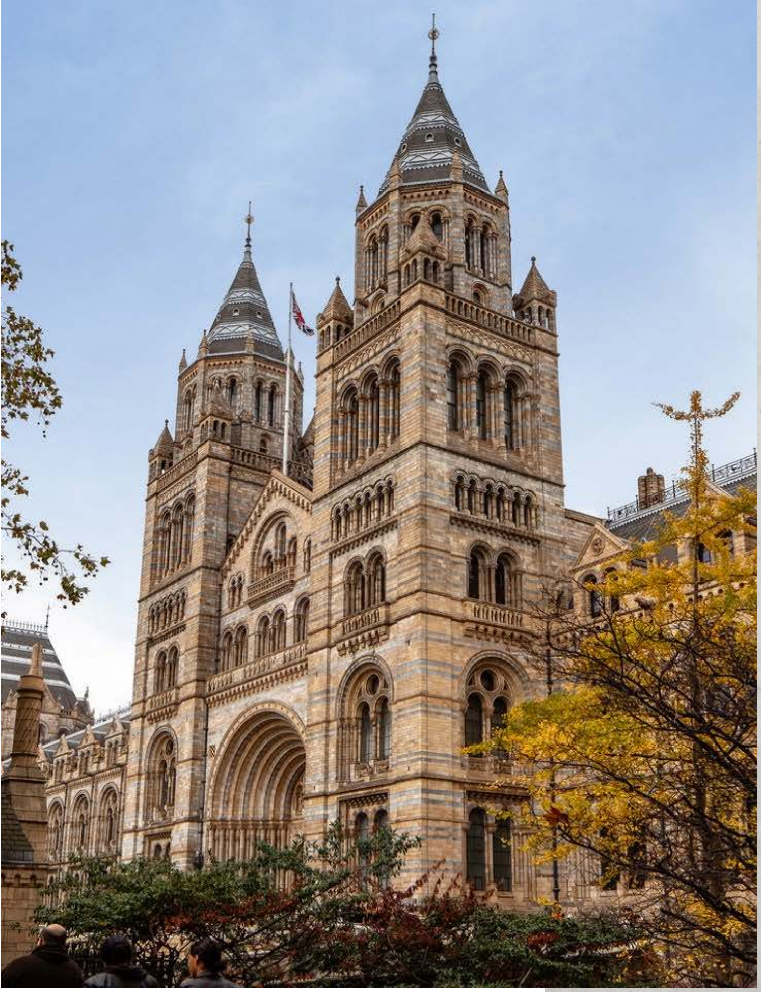
Natural History Museum