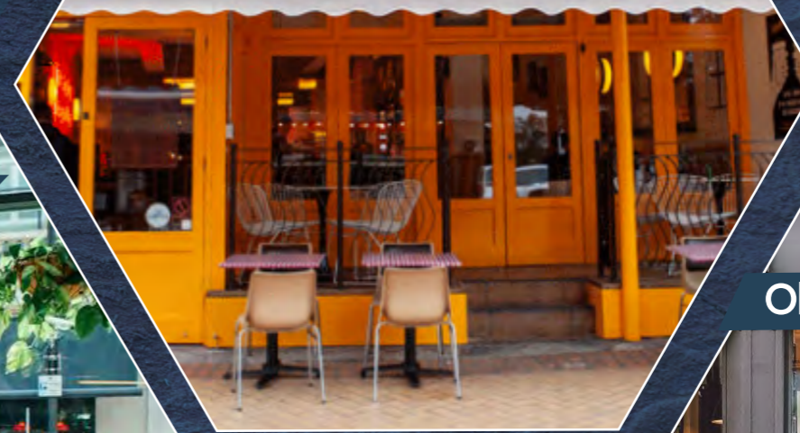
The Breakfast Club