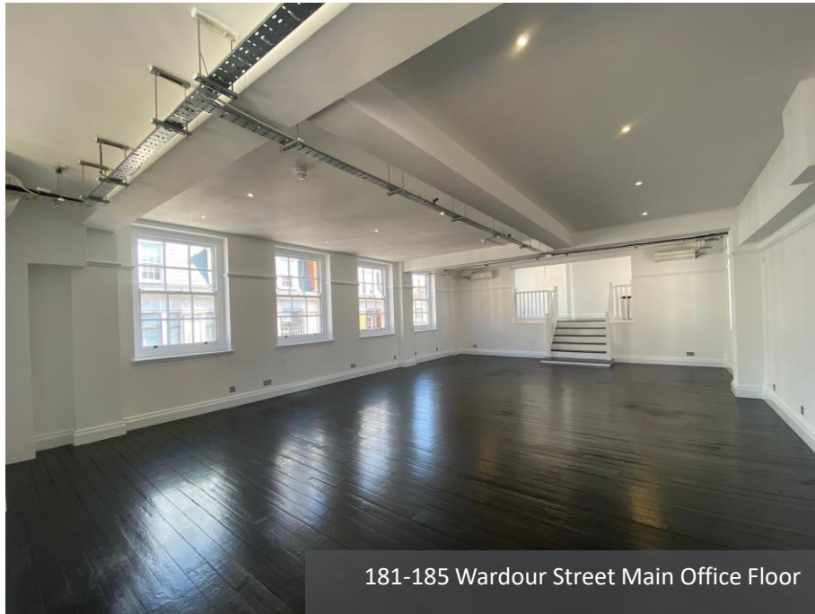
181-185 Wardour Street Main Office Floor