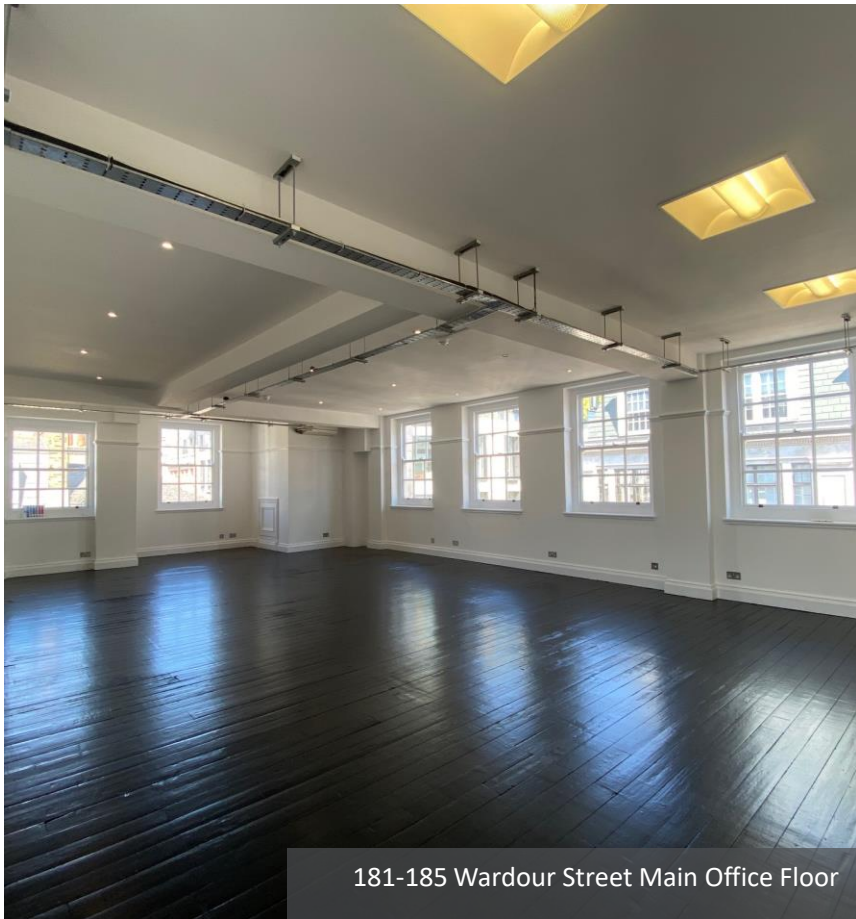
181-185 Wardour Street Main Office Floor