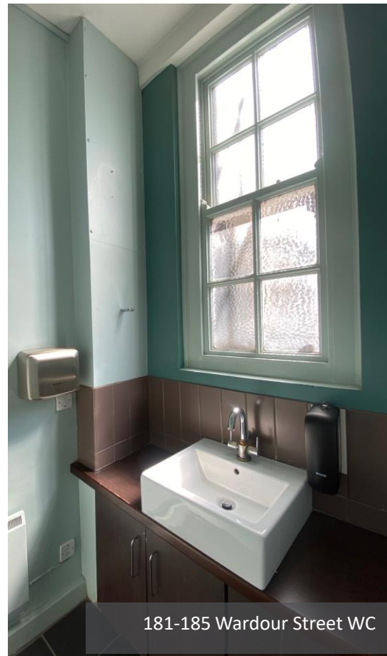
181-185 Wardour Street WC