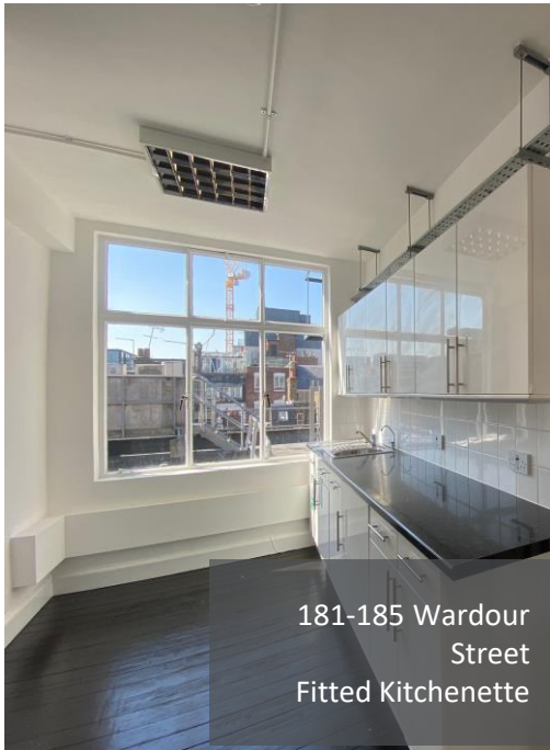
181-185 Wardour Street Street Fitted Kitchenette