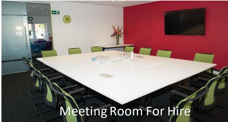
Meeting Room For Hire