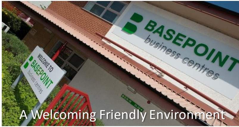
A Welcoming Friendly Environment