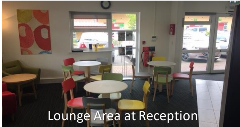
Lounge Area at Reception