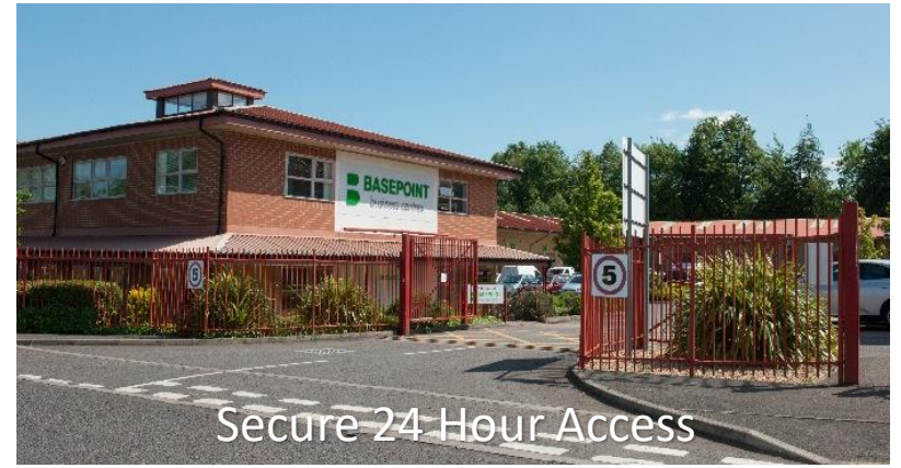
Secure 24-Hour Access