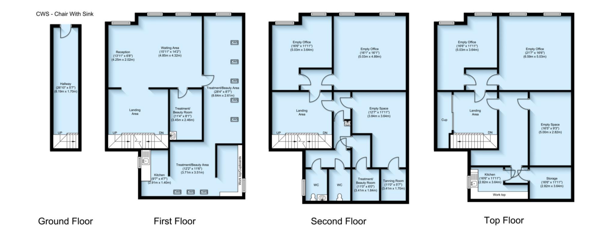
Illustration for identification purposes only, not to scale.