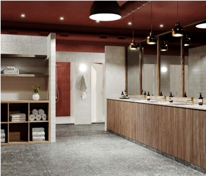
Best In Class End of Journey Facilities