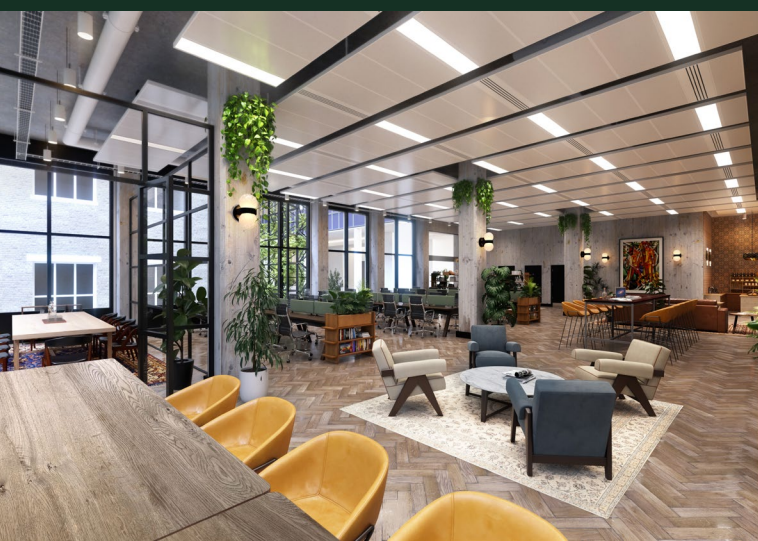
CGI: GROUND FLOOR FULLY FITTED