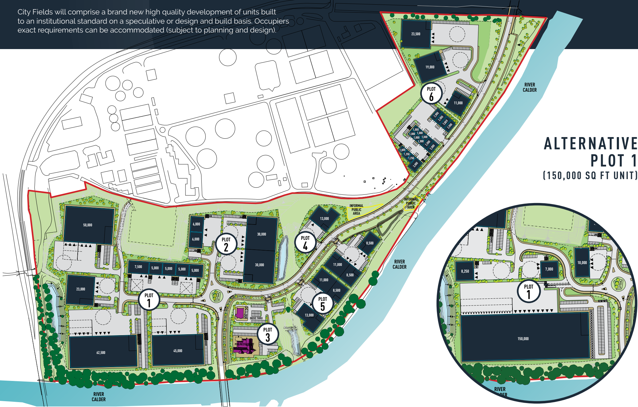
ALTERNATIVE PLOT 1 (150,000 SQ FT UNIT)

City Fields will comprise a brand new high quality development of units built to an institutional standard on a speculative or design and build basis. Occupiers exact requirements can be accommodated (subject to planning and design).