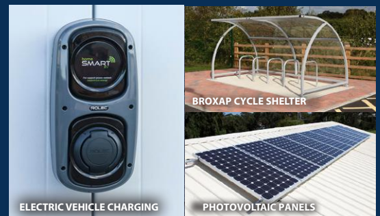
ELECTRIC VEHICLE CHARGING