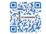
Our Building Code

HIGH SPECIFICATION OFFICE AND RECEPTION SPACES