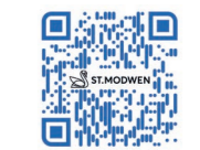
Our Park Code