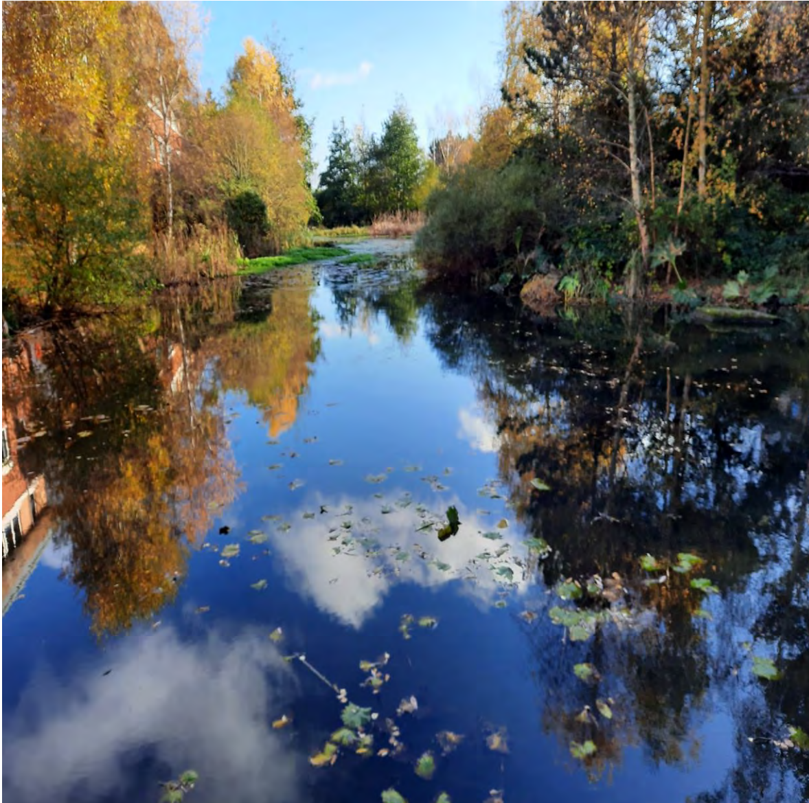
Lake to Rear