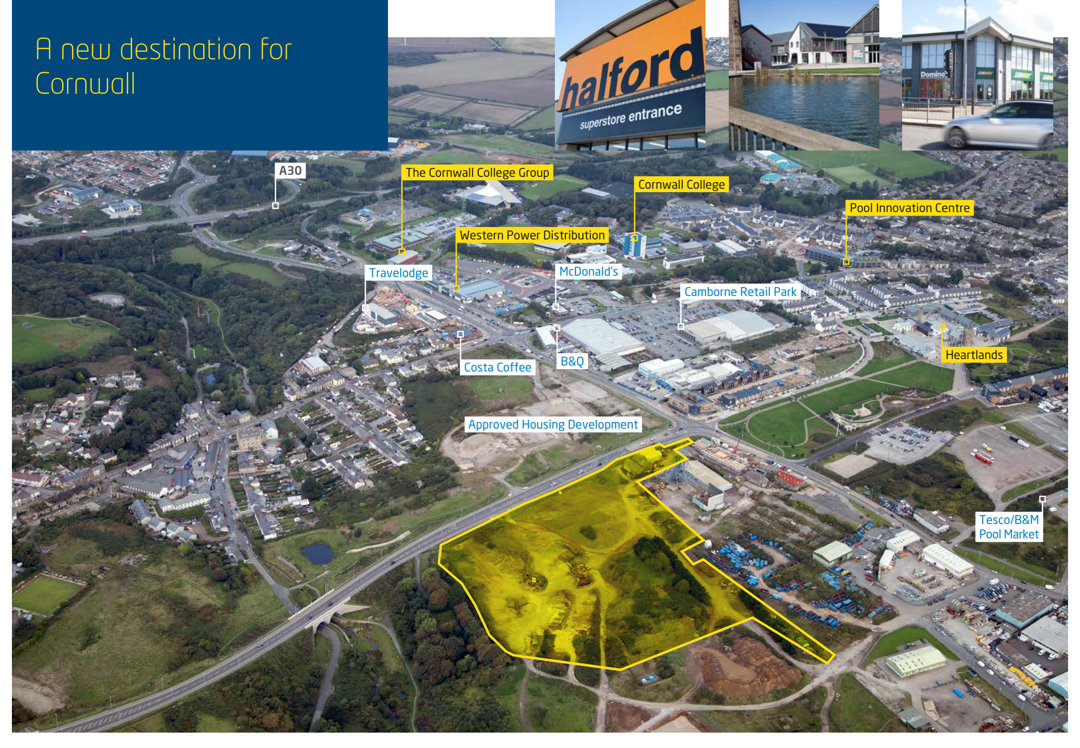
South Crofty Retail and Business Park Kerrier Way Pool Cornwall TR15 3QT