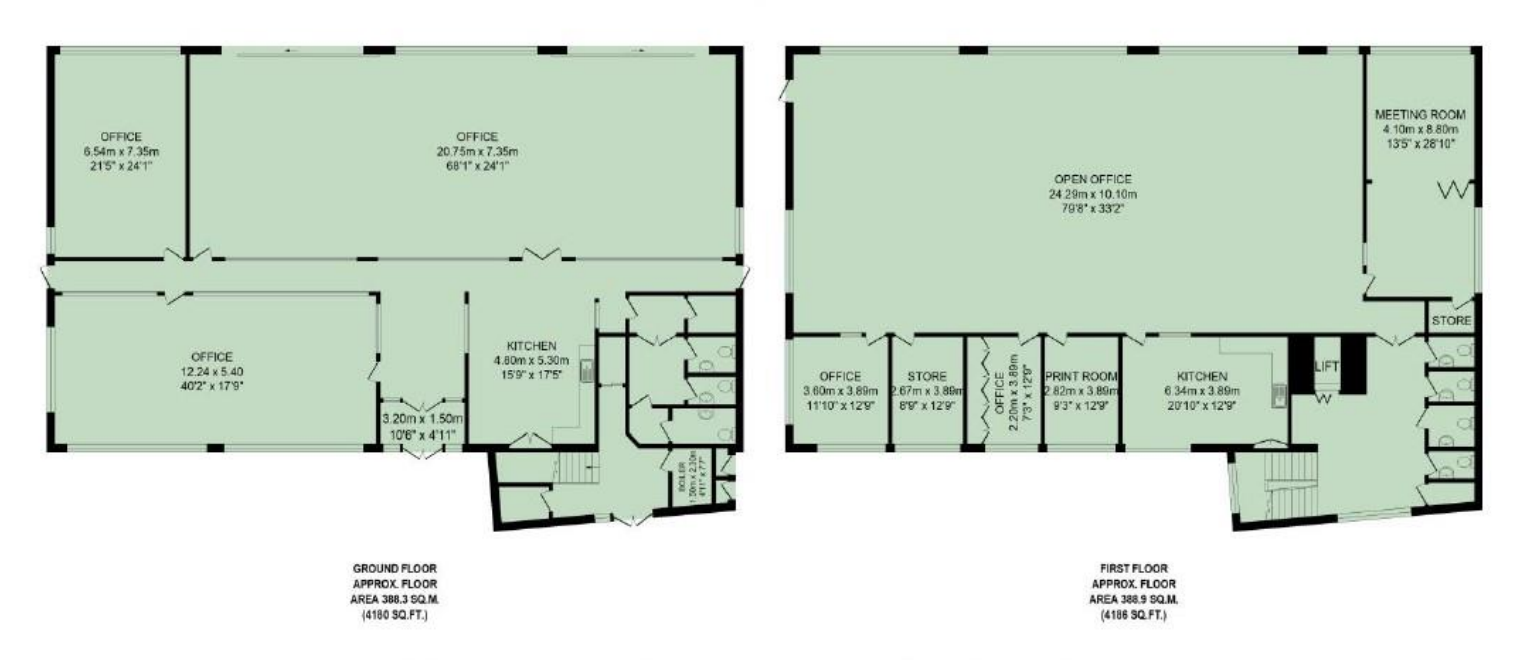
Building 3, Capital Court, Bittern Road, Sowton Estate, Exeter, Devon, EX2 7FW Approximate internal area 777.2 Sq.M. - (8366 Sq.ft.)