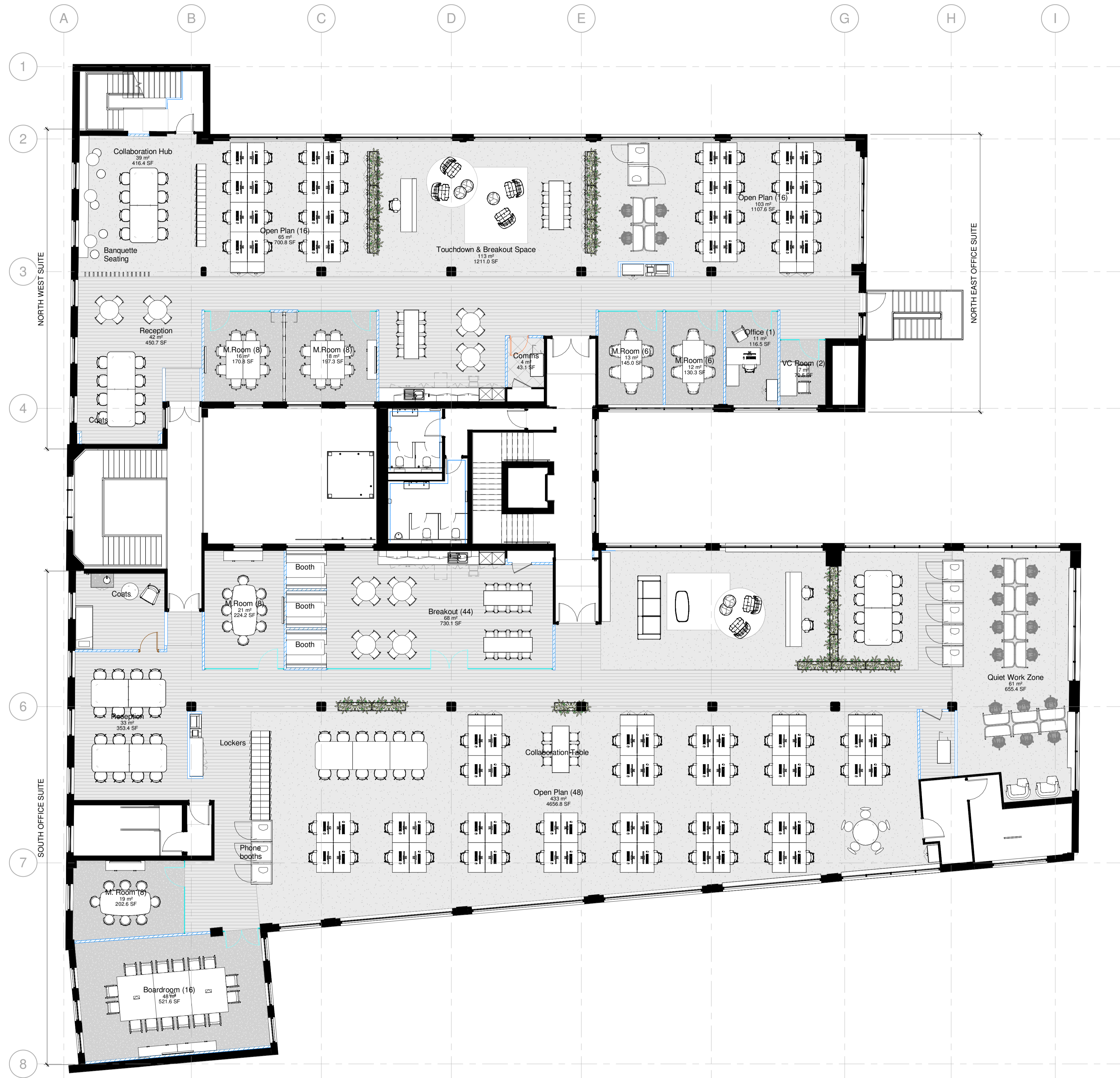
1 Second Floor - General Arrangement Plan 1 : 100

E: sales@woodhouseworkspace.com W: www.woodhouseworkspace.com