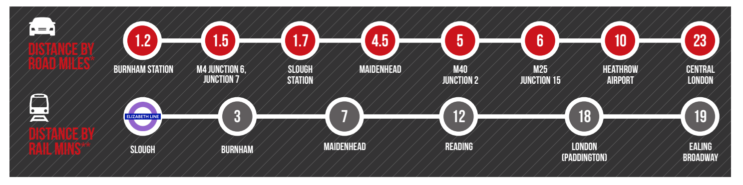
SOURCE: * FROM 959 WESTON ROAD SL1 4HR. SOURCE: THE AA ** TIMES FROM SLOUGH STATION. SOURCE: NATIONAL RAIL ENQUIRIES