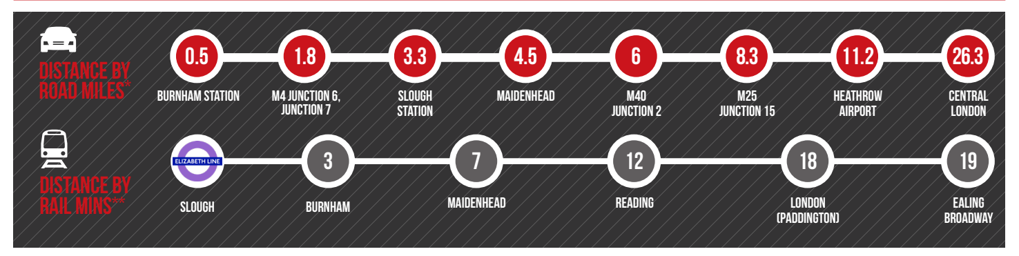
SOURCE: * FROM 883 PLYMOUTH ROAD SL1 4LP: THE AA ** TIMES FROM SLOUGH STATION. SOURCE: NATIONAL RAIL ENQUIRIES