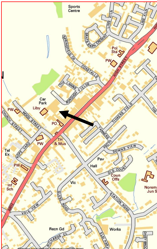
Google Maps. Not to scale, for identification purposes only