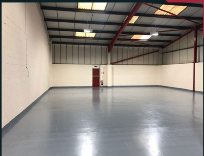
Indicative images for illustrative purposes only.

cheney manor industrial estate To Let | 4,935 sq.ft unit