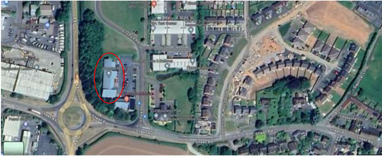
For Identification Purposes Only