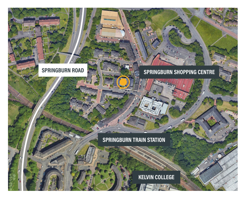
FOR IDENTIFICATION PURPOSES ONLY. NOT TO SCALE.