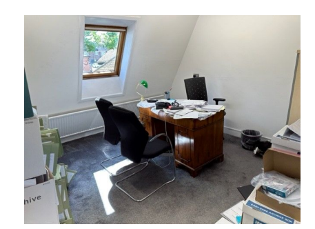
Rent: £1,150 Per month + VAT Size: 263 Square feet Ref: #3195 Status: New on!