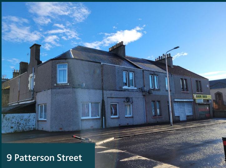
9 Patterson Street