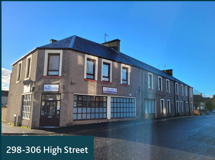
298-306 High Street