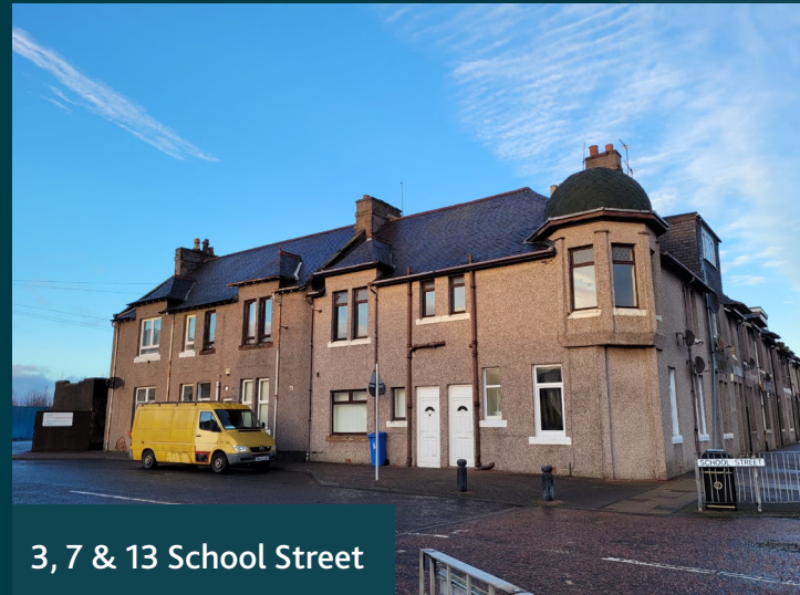
3, 7 & 13 School Street