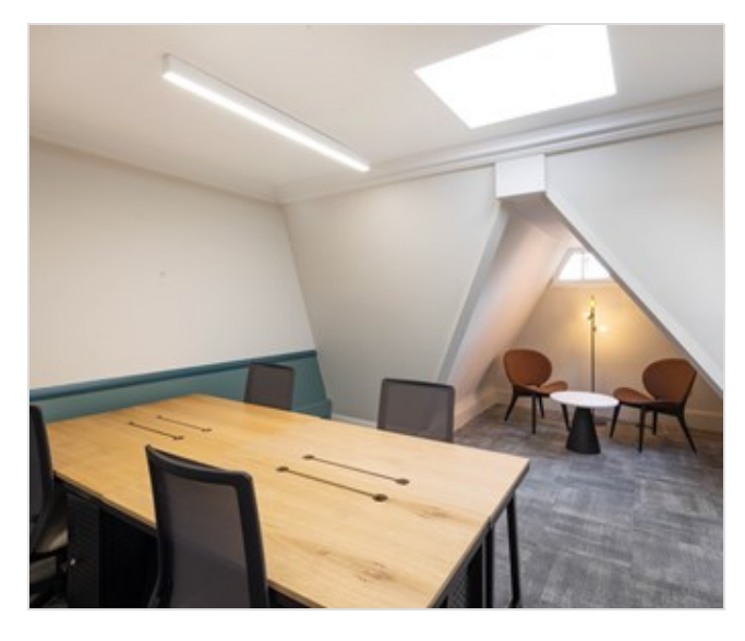
130-132 Buckingham Palace Road, London, SW1W 9SA