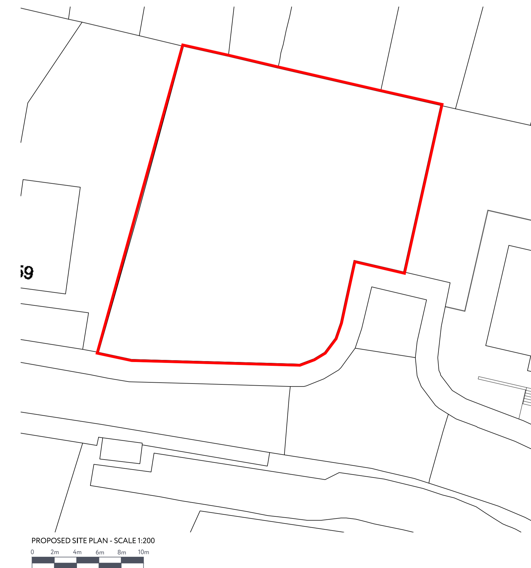
PROPOSED SITE PLAN - SCALE 1:200