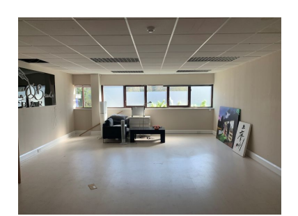
Rent: £10,000 Per annum + VAT Size: 565 Square feet Ref: #2744 Status: Available