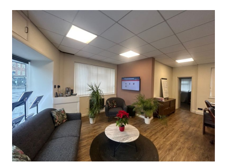
Rent: £15,000 Per annum Size: 540 Square feet Ref: #3181 Status: New on!