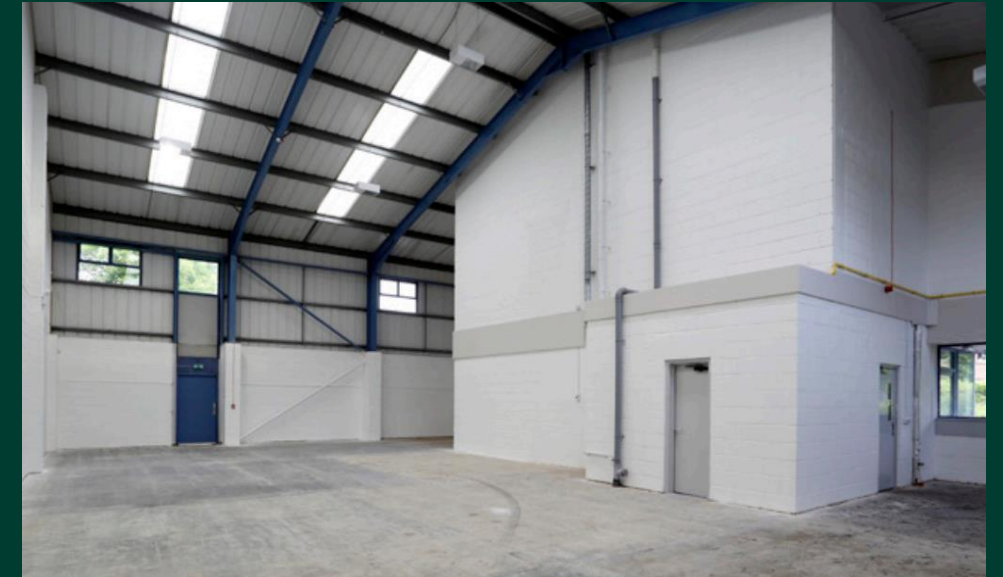
Typical Cleared Warehouse