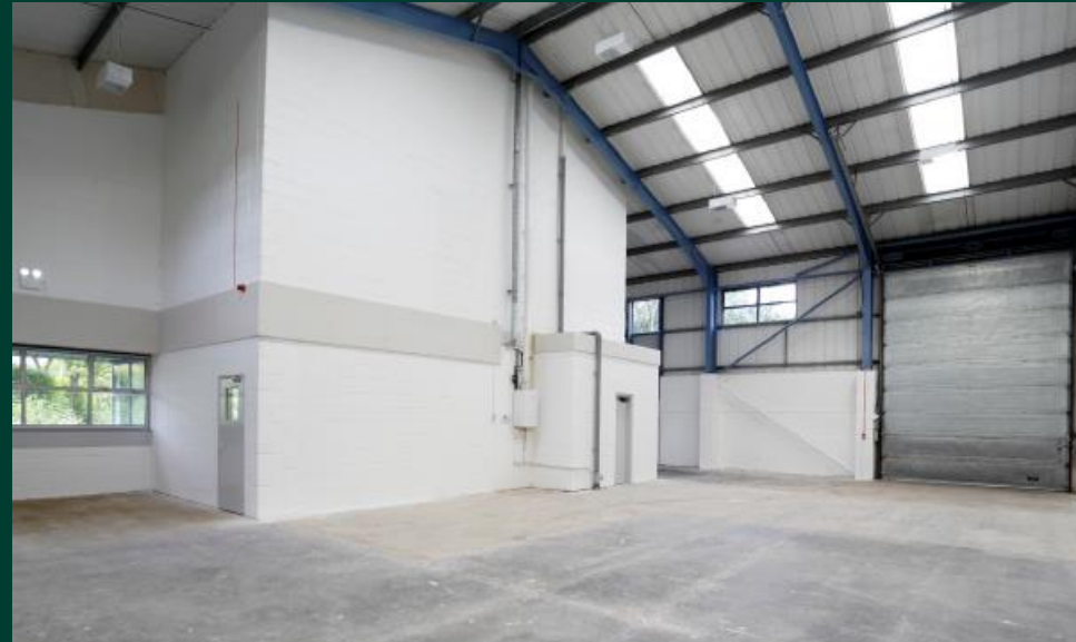
Typical Cleared Warehouse