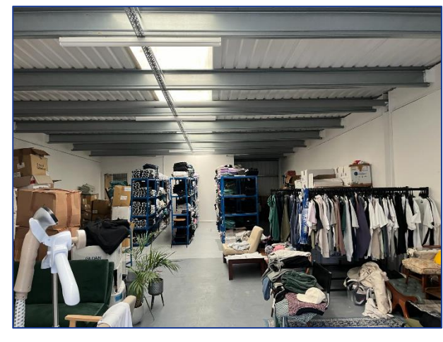
Unit 4 – First Floor