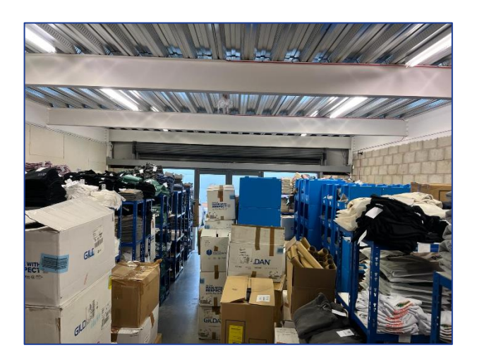
Unit 12 – Ground Floor