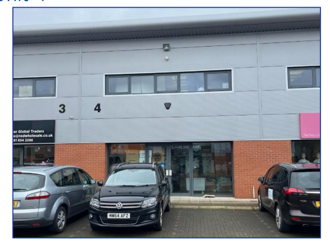
Unit 4 – Front Elevation