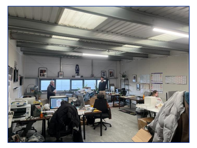
Unit 12 – First Floor