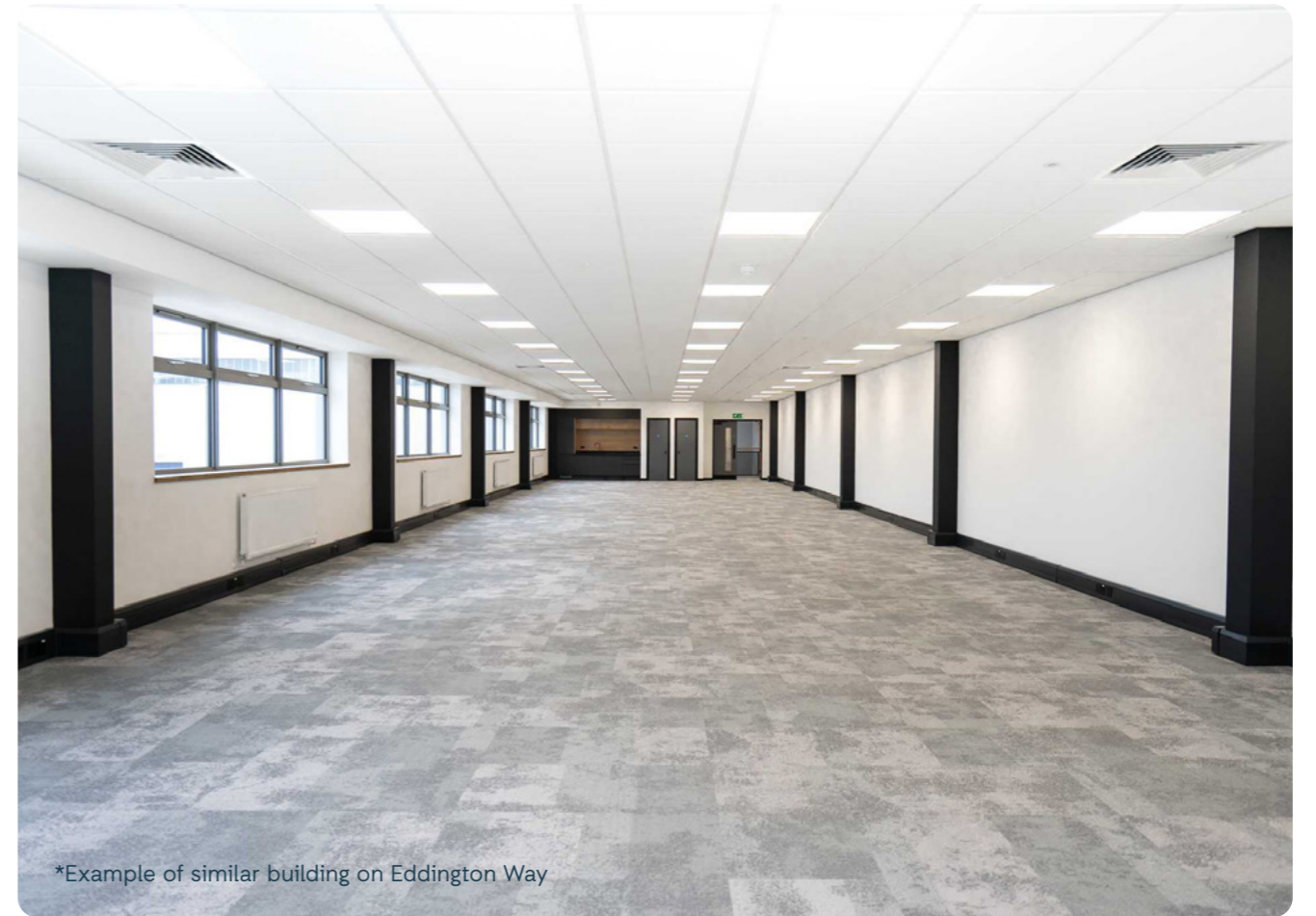
*Example of similar building on Eddington Way