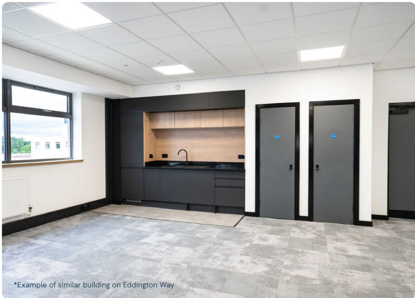
*Example of similar building on Eddington Way