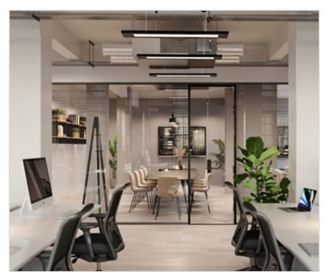
Union House, 182-194 Union Street, London, SE1 0LH