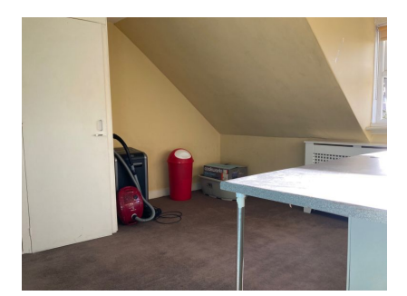
Rent: £495 Per month Size: 394 Square feet Ref: #3165 Status: New on!