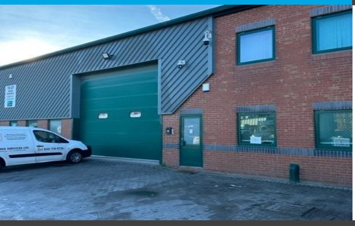
Unit 1, Oasis Business Centre, Brinnell Drive, Irlam, M44 5BL