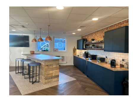
Rent: £88,000 Per annum Size: 2,950 Square feet Ref: #3162 Status: New on!